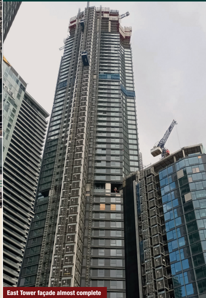
East Tower façade almost complete