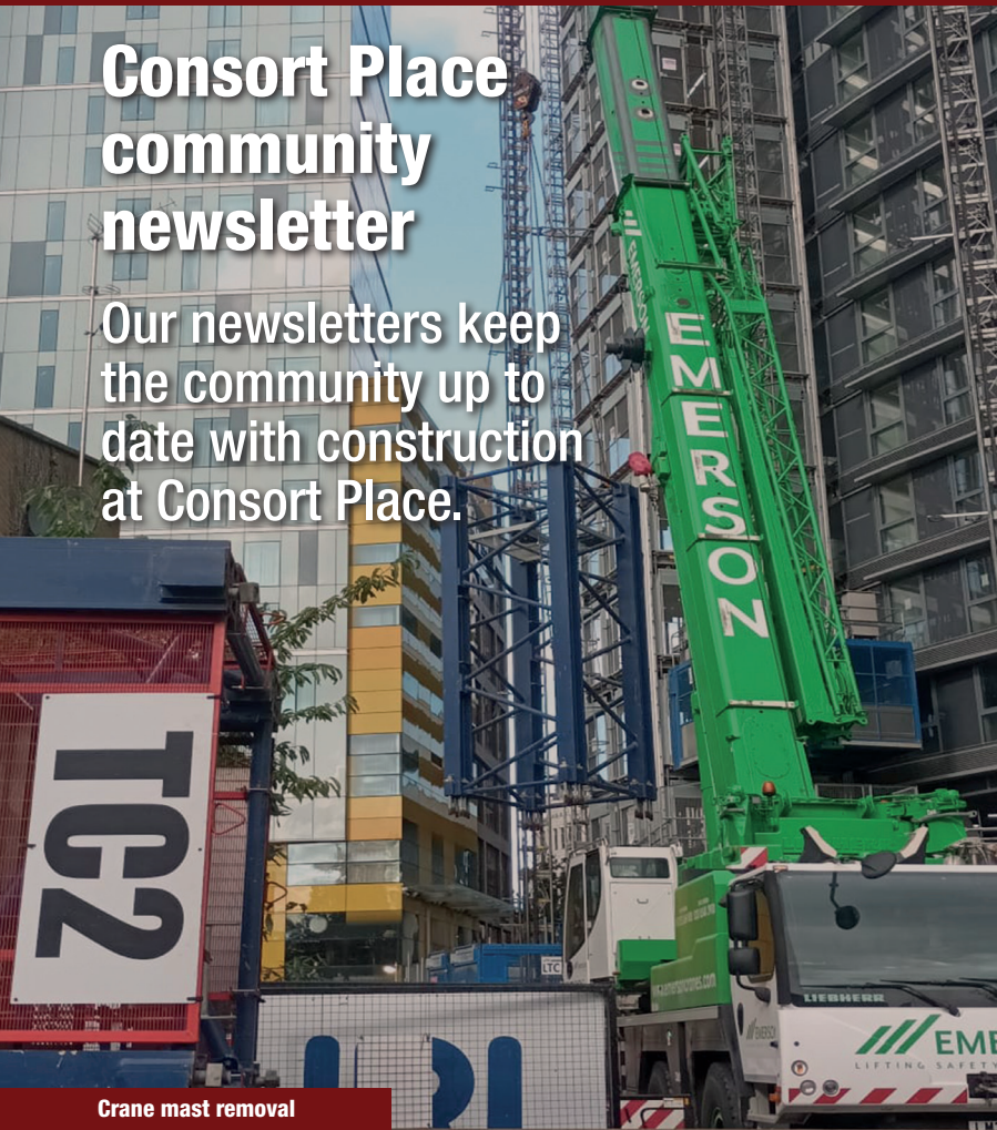
Crane mast removal

Last month, we completed balcony works and apartment fit-outs at the West Tower and continued façade installation at the school and East Tower. Next month marks another milestone with section 2 handover (L6-32 apartments, residential entrance and car park).