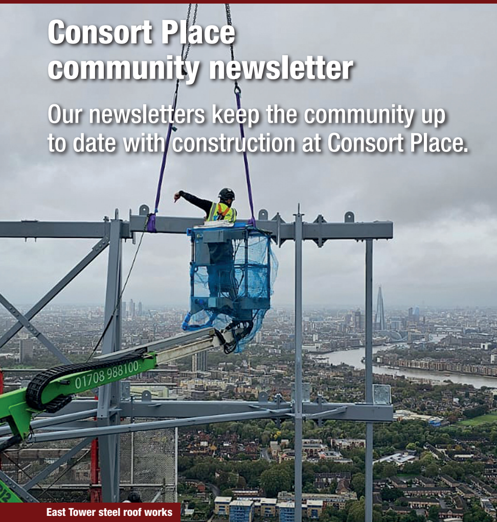
East Tower steel roof works

Our newsletters keep the community up to date with construction at Consort Place.