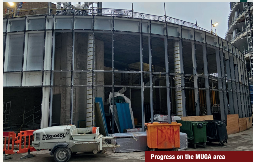
Progress on the MUGA area