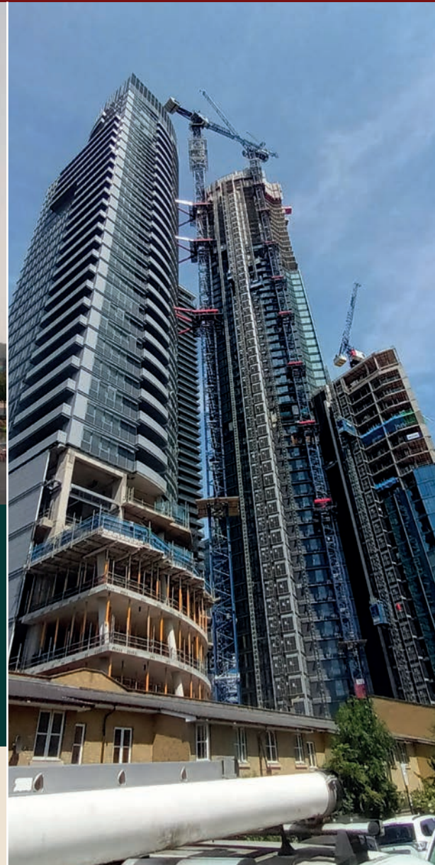
West Tower (left) balcony and roof works are complete, with school lift and façade works ongoing. The East Tower (right) has risen to its final height

07778 665906 | consortplaceconstruction@secnewgate.co.uk | www.consortplaceconstruction.com