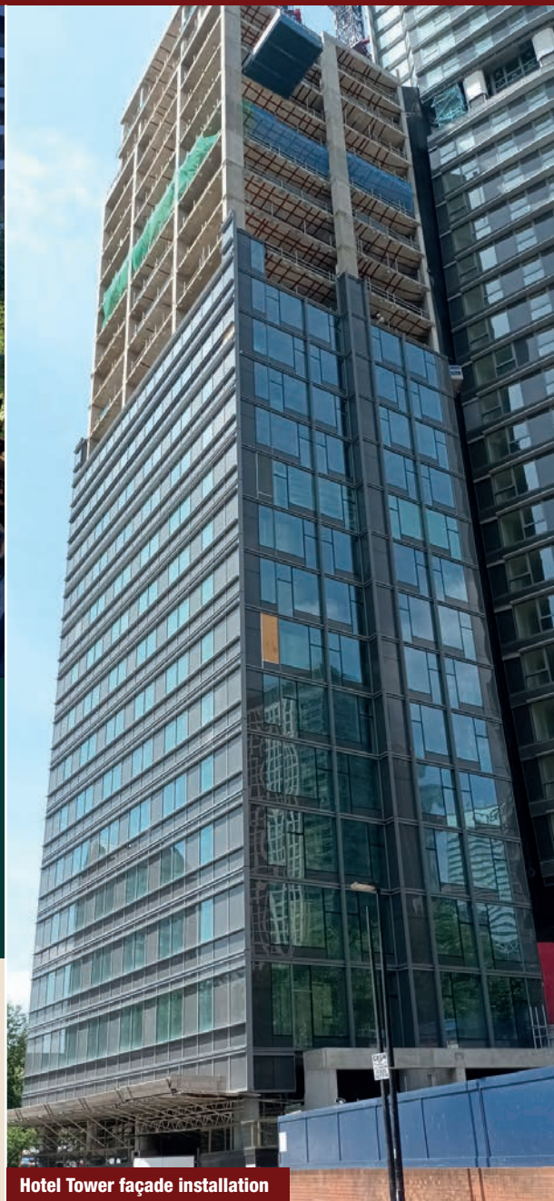
Hotel Tower façade installation

07778 665906 | consortplaceconstruction@secnewgate.co.uk | www.consortplaceconstruction.com