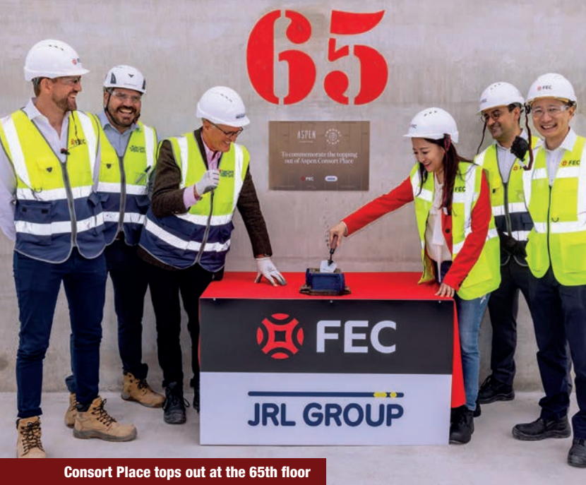
Consort Place tops out at the 65th floor

Our newsletters keep the community up to date with construction at Consort Place.