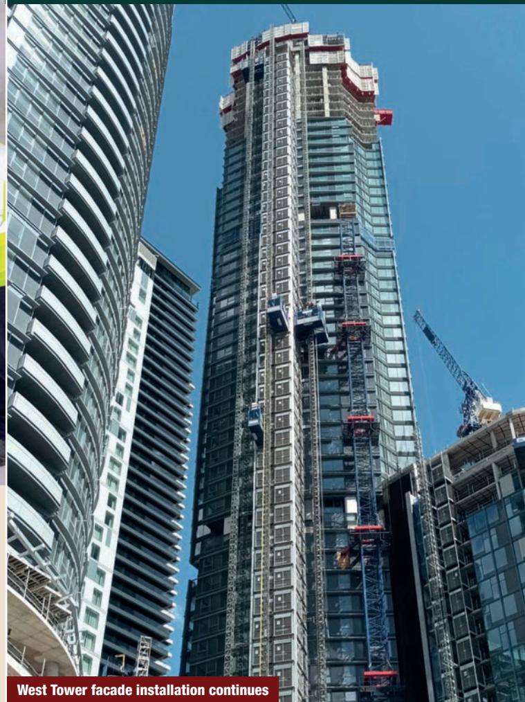
West Tower facade installation continues

In August, FEC and its contractors were delighted to celebrate the topping out of Aspen at Consort Place at the 65th storey. In September we will complete balcony works and apartment fit-outs at the West Tower, and continue façade installation on the East Tower and Hotel.