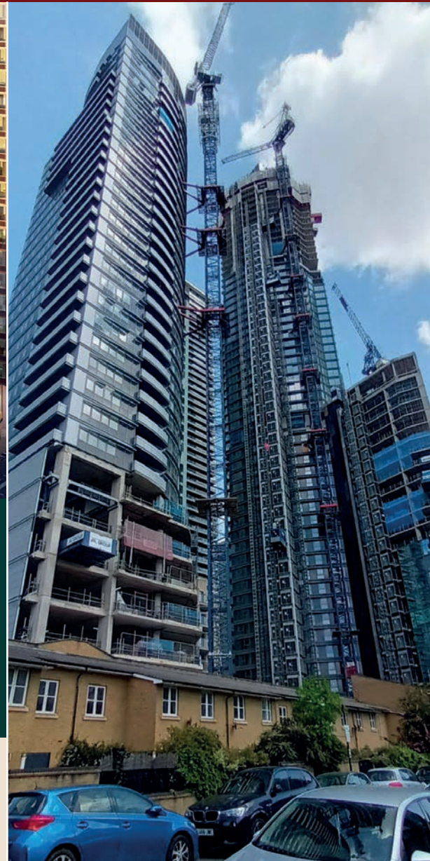
West Tower (left) façade installation and mechanical and electrical roof planting are now complete. The East Tower (right) continues to rise

07778 665906 | consortplaceconstruction@secnewgate.co.uk | www.consortplaceconstruction.com