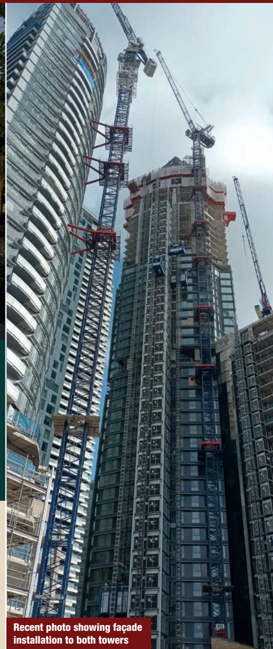
Recent photo showing façade installation to both towers

07778 665906 | consortplaceconstruction@secnewgate.co.uk | www.consortplaceconstruction.com