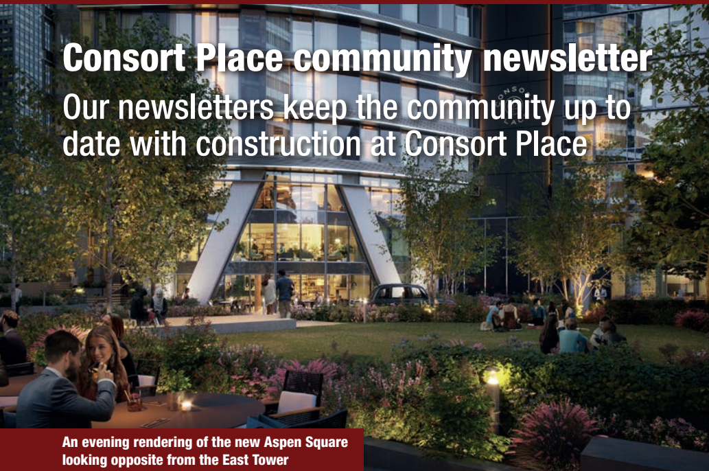
An evening rendering of the new Aspen Square looking opposite from the East Tower

Our newsletters keep the community up to date with construction at Consort Place