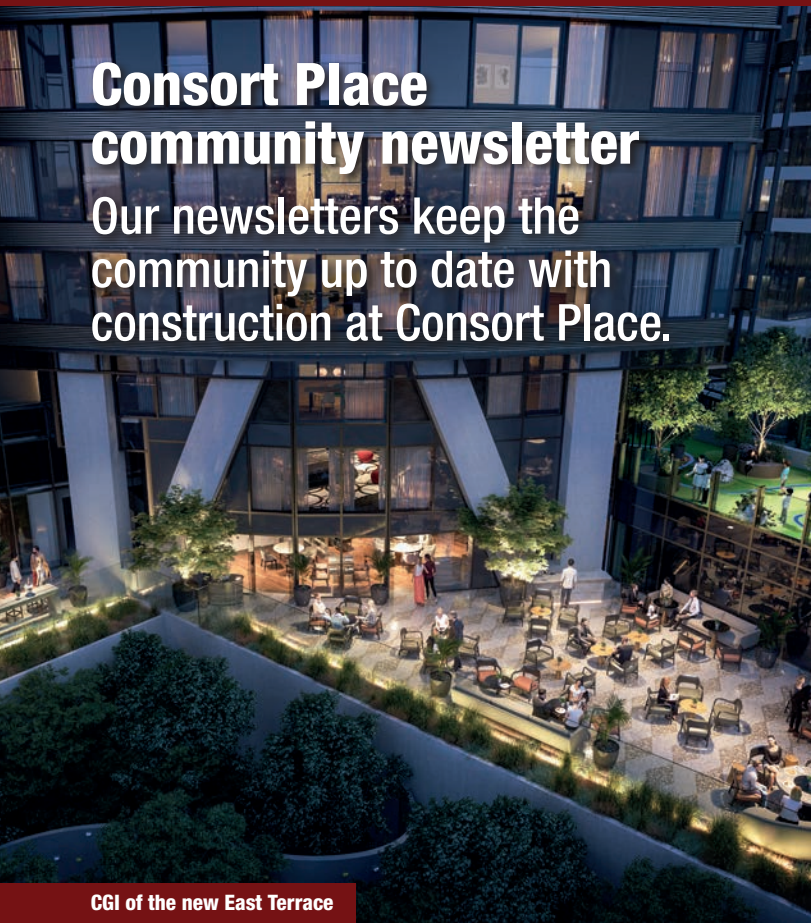
CGI of the new East Terrace

Our newsletters keep the community up to date with construction at Consort Place.