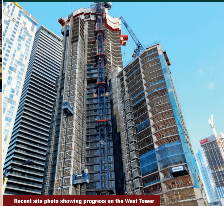
Recent site photo showing progress on the West Tower

As another year begins, we will see more fantastic progress take place with the construction of Consort Place. This month we will begin work on the West Tower's school lift and façade. We will also begin installing the hotel façade on the Hotel Tower.