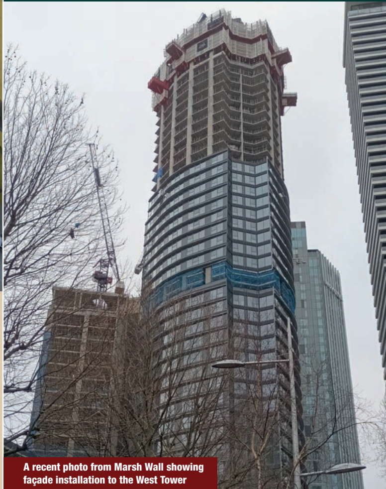
A recent photo from Marsh Wall showing façade installation to the West Tower

In February, we completed the mezzanine floor façade steel works on the West Tower and the concrete frame on the Hotel Tower. This month we will begin work on the East Tower's school lift and continue with the hotel façade installation.