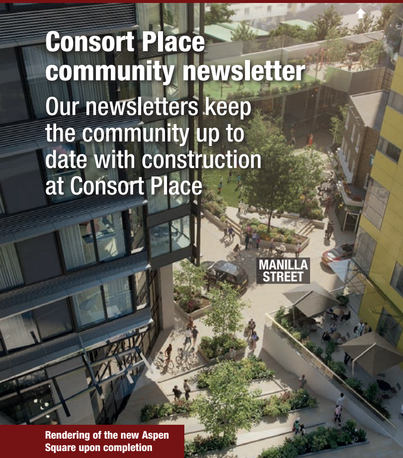
Rendering of the new Aspen Square upon completion

Our newsletters keep the community up to date with construction at Consort Place