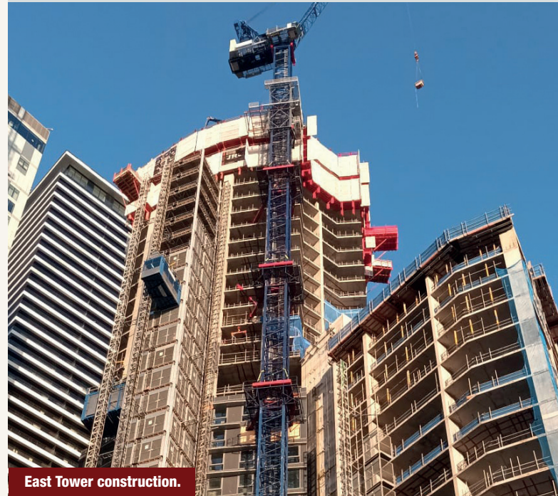
East Tower construction.