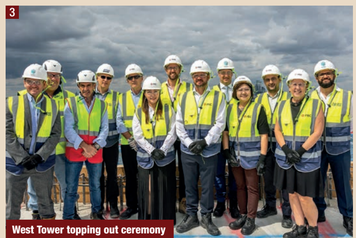
West Tower topping out ceremony