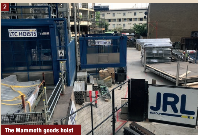
The Mammoth goods hoist