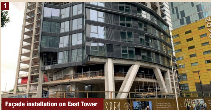
Façade installation on East Tower