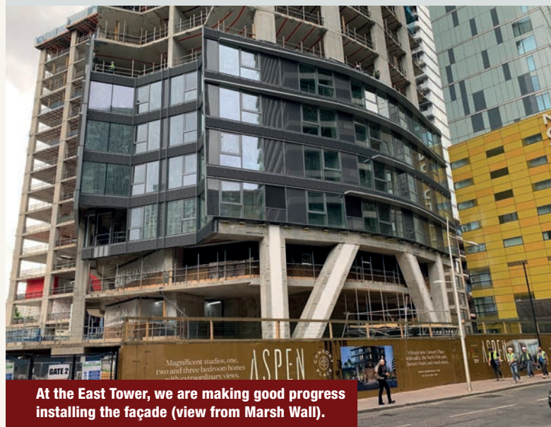
At the East Tower, we are making good progress installing the façade (view from Marsh Wall).

MANILLA STREET EAST OF CUBA STREET HAS A ROAD CLOSURE IN PLACE 72 MANILLA STREET (SEPARATE SITE) CONSORT PLACE (ASPEN) MARKETING SUITE