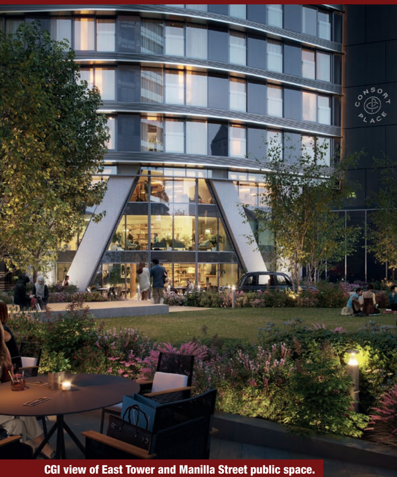
CGI view of East Tower and Manilla Street public space.