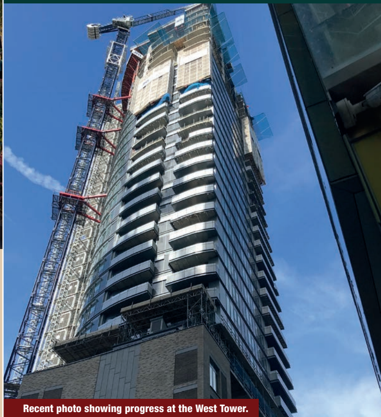
Recent photo showing progress at the West Tower.

Thames Water's works will progress in stages along with the length of Byng Street. The work is due to be completed in October 2022.