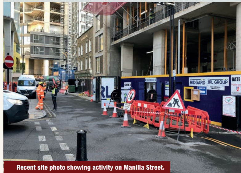
Recent site photo showing activity on Manilla Street.