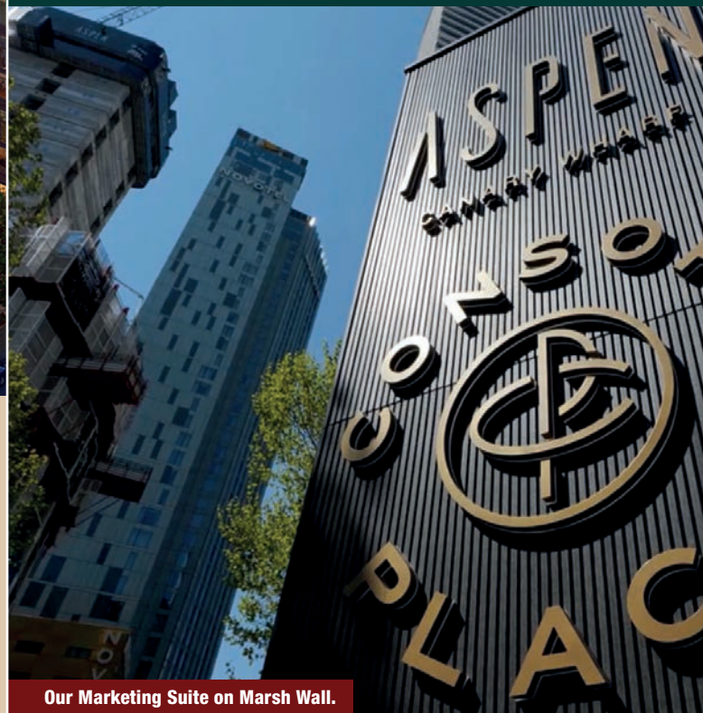
Our Marketing Suite on Marsh Wall.