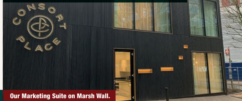
Our Marketing Suite on Marsh Wall.