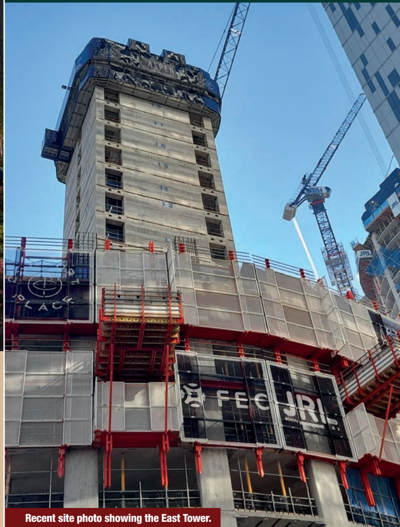
Recent site photo showing the East Tower.

We have installed safety screens on the East Tower. This month we will be starting to install the building's façade (external face).