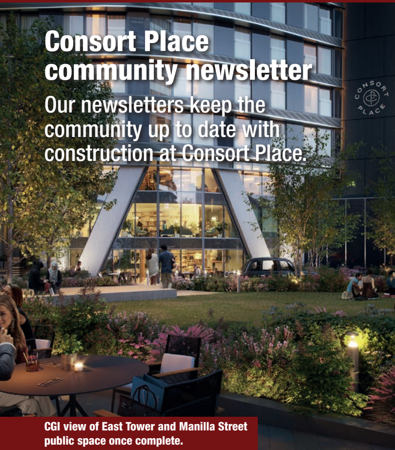
CGI view of East Tower and Manilla Street public space once complete.

Our newsletters keep the community up to date with construction at Consort Place.