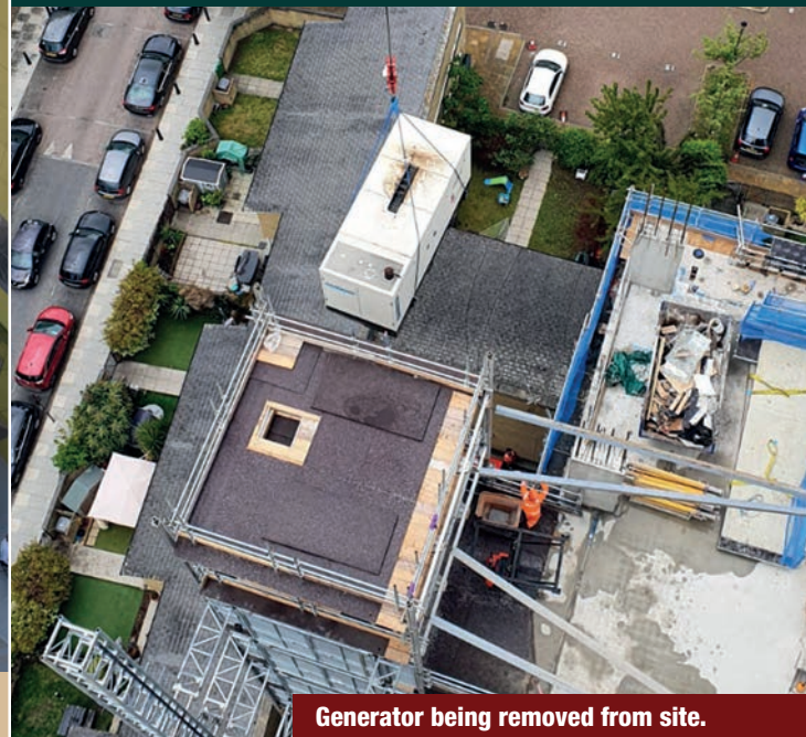
Generator being removed from site.

With a power supply to the site installed, we have been able to remove generators from the site. This process was completed in May – all generators have now been removed from site.