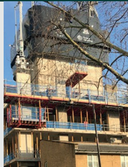
A slipform rig (behind black covering) will construct the building.

Slipform rigs are now installed at both the West Tower and East Tower. A slipform rig enables concrete to be poured at height. The slipform rig will rise upwards, pouring concrete for the core. It can operate continuously or can be stopped and started to suit.