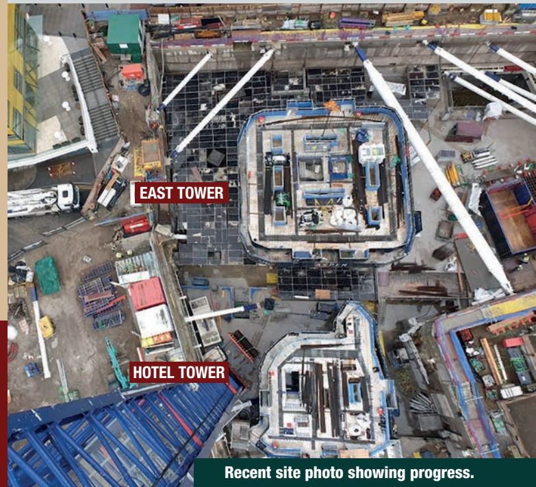
Recent site photo showing progress.