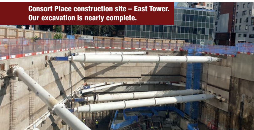
Consort Place construction site – East Tower. Our excavation is nearly complete.

We follow rigorous safety standards. Our crane, manufactured in 2020, is subject to daily inspection. All lifts are planned and carried out under full supervision. Safety on site is paramount.