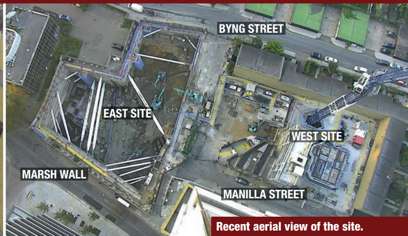
Recent aerial view of the site.

Consort Place will provide new homes, a hotel, a new pub, an education facility and public realm.