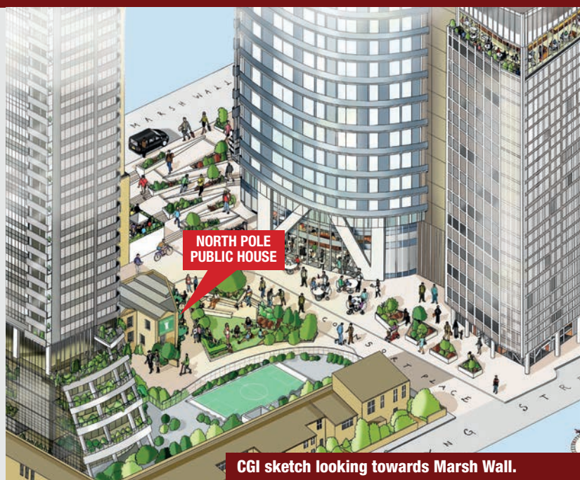
CGI sketch looking towards Marsh Wall.