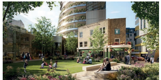
CGI of North Pole pub once completed.

Following from our previous information sessions in September and October, we plan to hold another information session on Wednesday 29 January 2020 (5-7pm) at Phoenix Heights Community Centre, 140 Byng Street, E14 9AR. This will give local people the chance to provide feedback or ask questions or members of the project team.