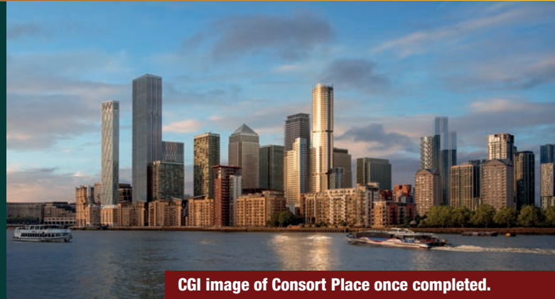
CGI image of Consort Place once completed.