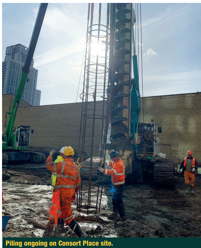
Piling ongoing on Consort Place site.

If you have any feedback, please see 'Keeping in touch' at the bottom of the page.