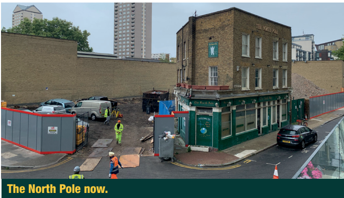
The North Pole now.

FEC have acquired the North Pole. Whilst it will be used to provide a base for workers during the construction of Consort Place, it will reopen as a public house once the development is finished.